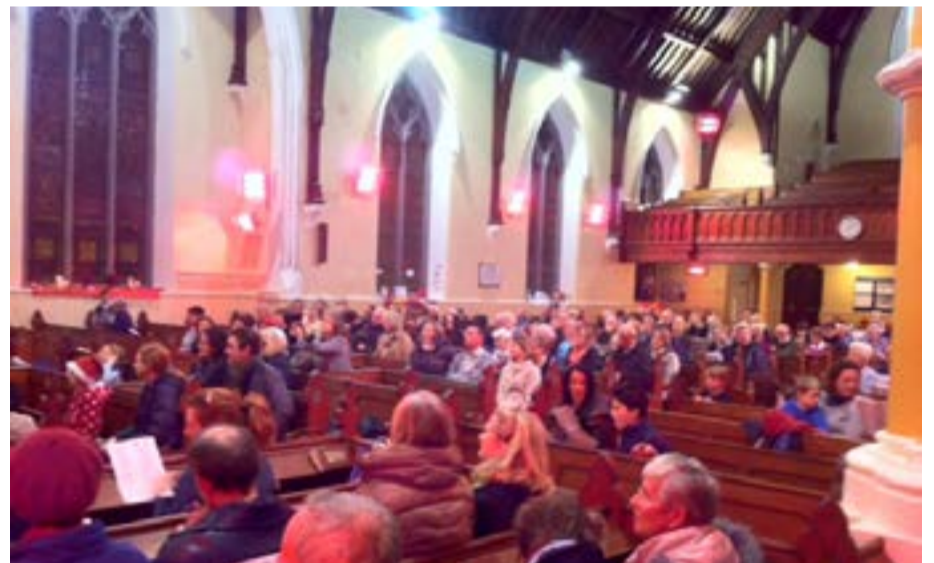
Christmas Day, 2015.

Representation on our worship committee will be widened to include representatives from the Youth and Family Committee and other members of the congregation to encourage wider congregational participation in worship - at present this is limited to the choir and volunteer readers. A wider variety of special services should be arranged with visiting or Gospel choirs enriching the worship experience from time to time.