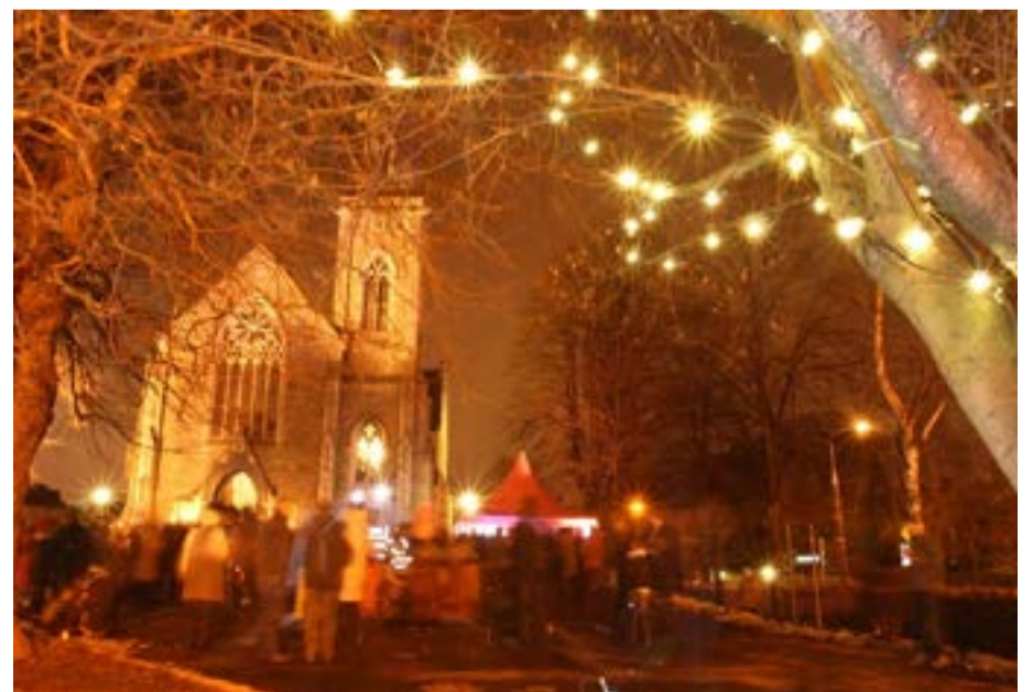
Carols for all, 2009.

The congregation also deserves as much information about the activity and decisions of the Church Committee and Session as can be given with due regard to the principles of confidentiality.