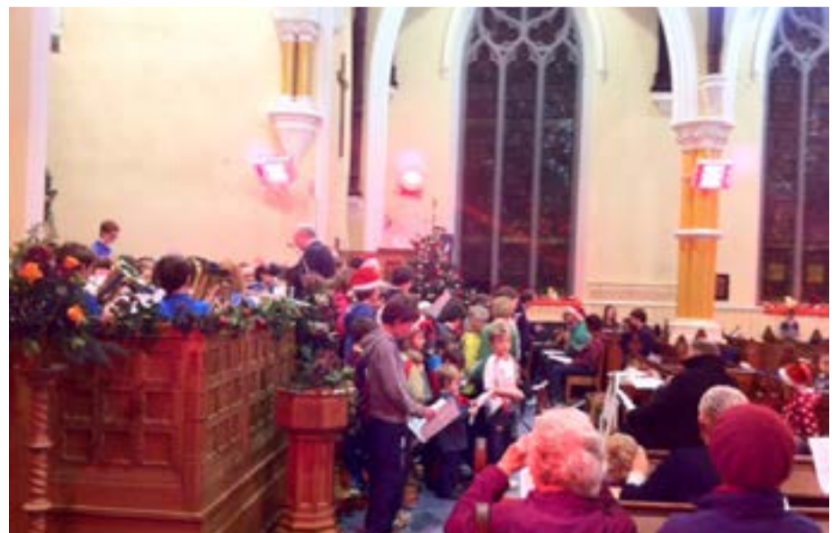
Christmas Day, 2015.