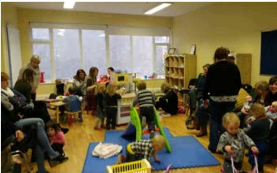
Mothers and Toddlers

We encourage our members to extend a warm welcome to any newcomers to our church events and to invite them to join with us in our worship and activities. We note the particular interests of the newcomer with a view to integrating him or her into the fabric of the Church community. For example, new members may be invited to take part in our worship as stewards or readers, to help in the mothers and toddlers group, to join in the horticultural society's work, or in music for worship, or on the catering committee. We know that this approach bears, and has borne fruit