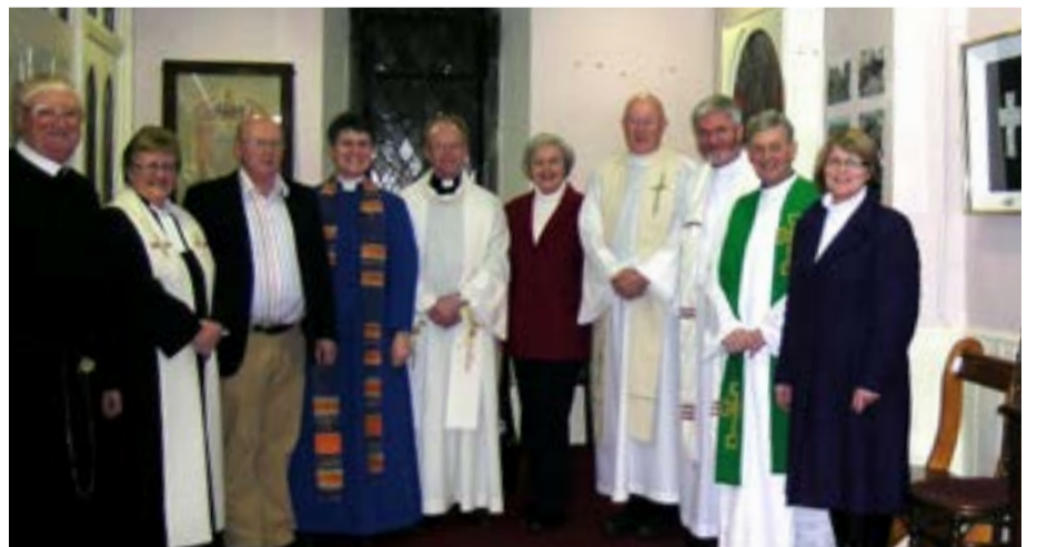
TO THE LEFT: Youth group trip to Uganda 2011. Screening a film to a class while visiting local schools. TOP: Week of Prayer for Christian Unity 2014. LOWER: Rathgar Unity, 2011.